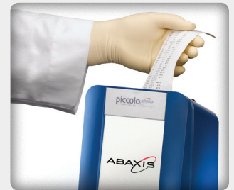
3 / Read results