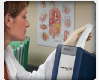
3 / Read results