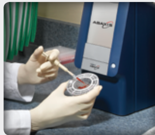
1 / Add sample

From draw to printed results in 3 easy steps and approximately 12 minutes