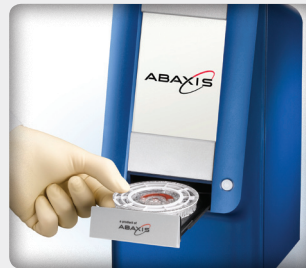
2 / Insert disc