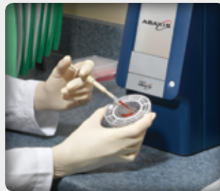
1 / Add sample

From draw to complete panels in 3 easy steps and approximately 12 minutes