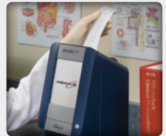
3 / Read results